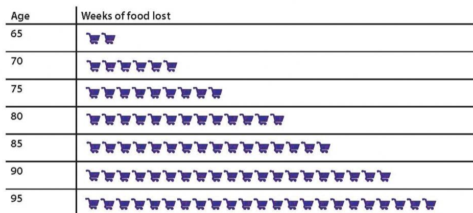
Figure 2. Weeks of food lost annually from chained CPI, single elderly woman with monthly benefit of $1,100

1 Empty Grocery Cart=1 Week of Food ($53 value in $2010)