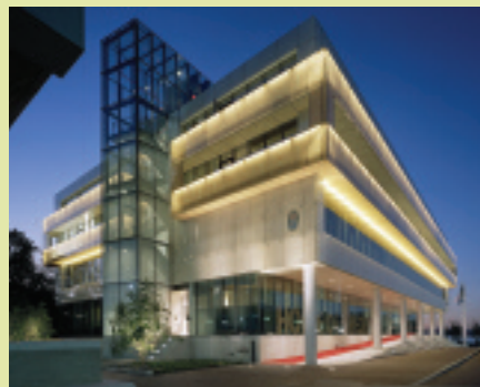
House of Sweden is the crown jewel of the Swedish presence in the U.S., nestled between Rock Creek and the Potomac River in historic Georgetown.

When: Thursday, October 1st • 6:30-9:30pm • Cocktail Reception Where: House of Sweden • 2900 K Street NW • Washington, DC 20007