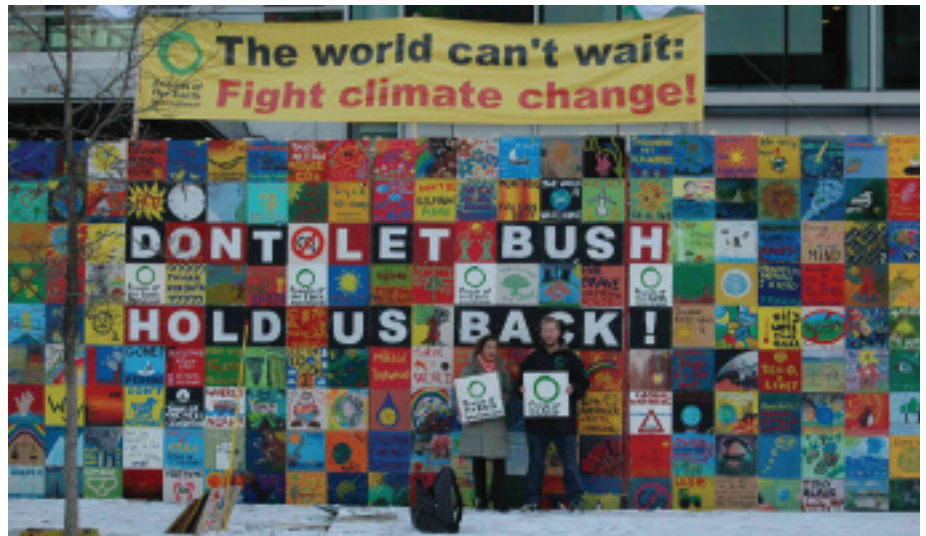
Friends of the Earth International had a strong presence at the 11th Conference of the Parties of the United Nations in Montreal in 2005.