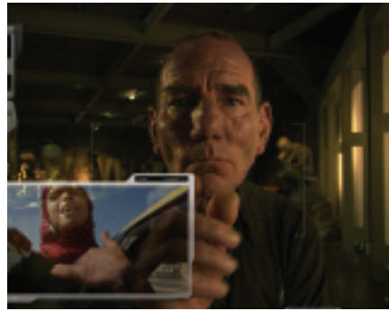
Oscar nominated actor Pete Postlethwaite interacting with the futuristic interface designed specifically for the film by designer Taiyo Nagano.

The film weaves together six different stories from six different people from six different regions in the world. Through their narratives, we come to see how big the problems are that we face, but the movie also delivers amazing proof