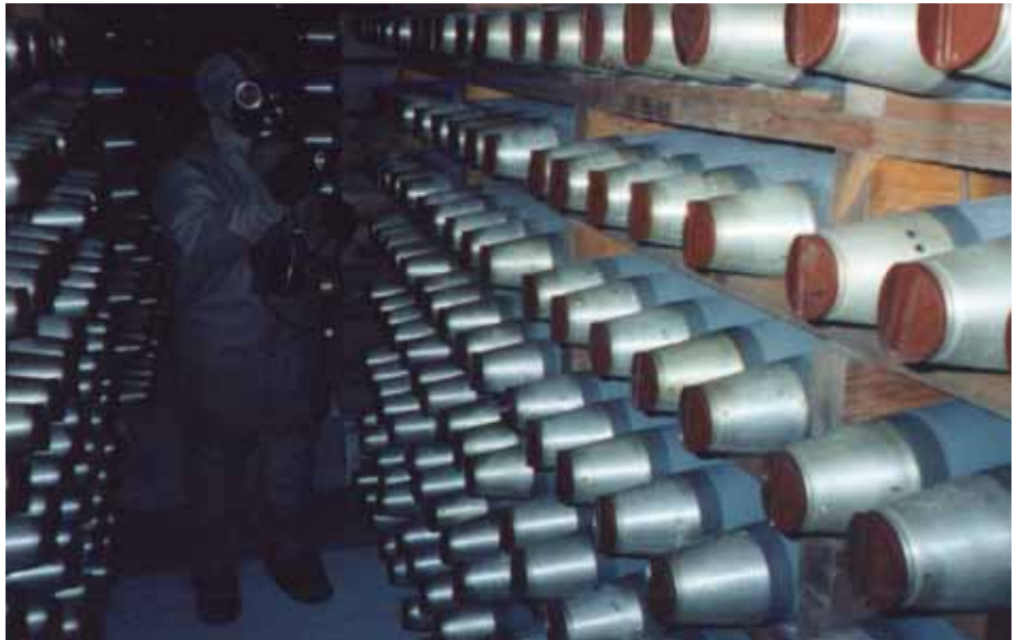
Russian artillery shells filled with VX nerve agent stored at Shchuch'ye, Kurgan Oblast, in Siberia.

The first time I visited an existing chemical weapons (CW) stockpile was in 1994 when I was a member of an official on-site inspection of one of Russia's largest stockpiles. This was a U.S. delegation including both congressional and executive branch members to visit the easternmost of seven declared Russian CW arsenals. We flew three hours east from Moscow and spent a full day inside a remote chemical weapons depot in Siberia, just north of Kazakhstan, inspecting some two million artillery and missile warheads filled with VX nerve agent. What struck us most at the time were two things: the enormous size of this arsenal, representing about 14 percent of the Russian CW arsenal; and the very poor security of the stockpile, housed in old above-ground, corrugated metal buildings with bicycle padlocks on the