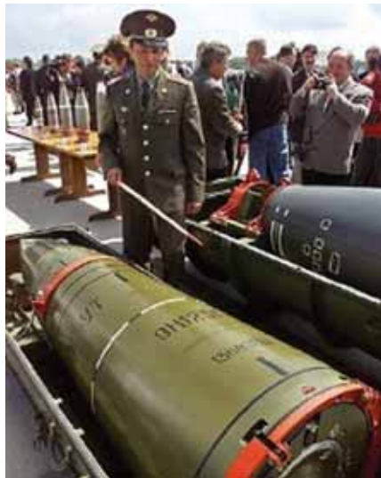
Russian missile warhead filled with VX nerve agent, stored at Shchuch'ye, Kurgan Oblast, in Siberia.

One of the major causes in schedule delays and cost escalation has been disagreement and uncertainty on the most appropriate technologies. Given that a minute amount of chemical agent can cause immediate death, and that many of them are packaged with explosives, most technologies of destruction have had to be both robotic and able to contain explosions. Incineration has been the technology of choice of the U.S. Army, while chemical neutralization with hot water (in the case of mustard agent) or with caustic reagents such as sodium hydroxide (in the case of VX, sarin, and soman nerve agents) has been chosen by Russia and four U.S. states.