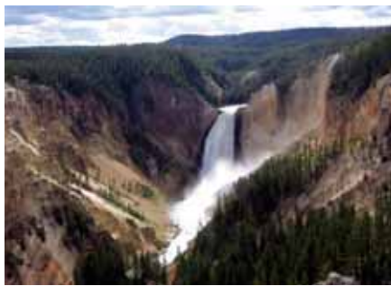
Yellowstone National Park

Most of the few ongoing bio-pharm field trials, however, now utilize non-food crops (like tobacco) or marginal food (safflower) crops. Corn, once the favorite crop for this reckless experimentation is little used now, thanks in part to Friends of the Earth's efforts.