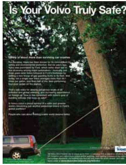
Bluewater Network recently ran this full-page ad in The New York Times , and Mother Jones online.

Amtrak is one of the most fuel efficient and environmentally friendly