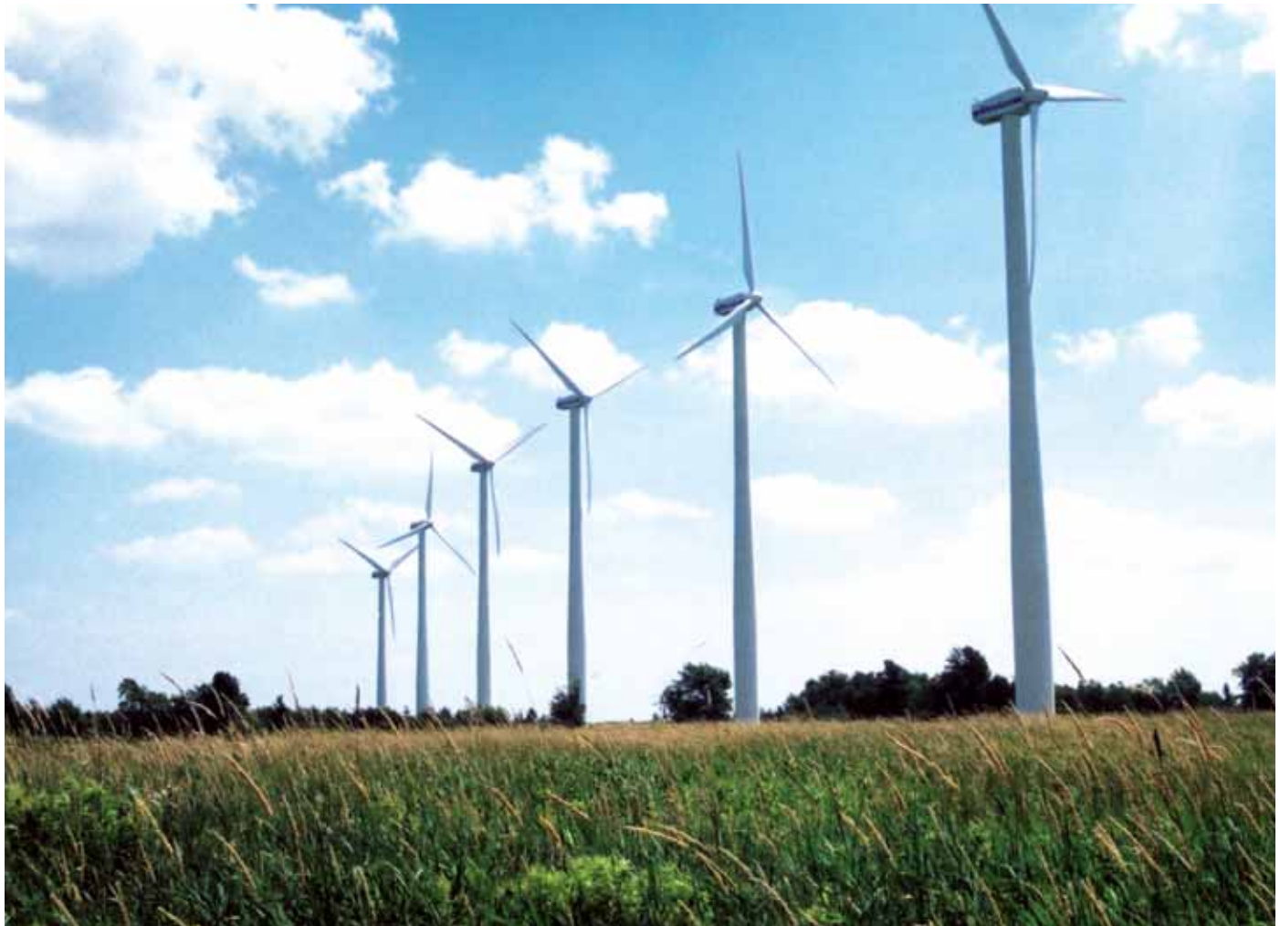
Wind energy is catching on in Gray County, Kansas. This installation is now generating 110 megawatts of power.

Wind power is becoming a more cost effective means of producing electricity every year, and it now rivals